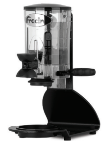
● Free Standing Dispenser