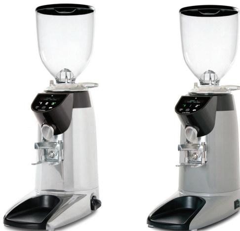
● E10 On Demand Polished

Designed for the speciality cafe and the most accomplished barista. Its features include a micrometric adjustment for precise dosing, multi language touch screen, automatic pre-selection of timed grinding, 2 working modes, refill button and an active password. Its powerful motor allows you to work continuously in situations of high demand whilst maintaining quality of the coffee, thanks to the cold grinding at low revolutions. The EOD range delivers 7 grams in 2.1 seconds and are fitted with durable grinder blades capable of grinding up to 500 kilos of coffee beans.