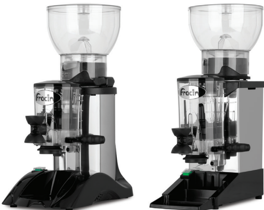
● Model B

These models provide exceptional value and excellent performance for the requirements of most coffee bar or restaurant venues. Manufactured with a contrasting black polycarbonate and polished stainless steel finish, the easily adjusted grinder burrs and integrated dispenser hopper for the ground coffee ensure simple, consistent operation and accurate portion control. Coffee is dispensed into the filter holder using the flick lever mechanism. Both the Model B and model T allow the user to control the quantity of ground coffee manually.