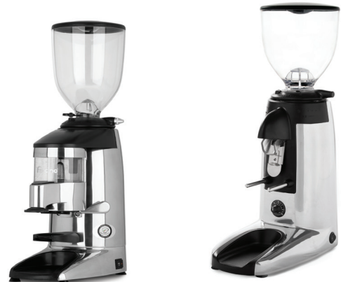
● K6 Professional Espresso Polished

The K series models are manufactured from die-cast aluminium and finished in silver or polished chrome. The K3 version, ideally suited to lower volume locations - or for speciality coffees - is available as a single shot, on-demand grinder or with the integrated die cast dispenser to suit different user requirements. The more powerful K6 version features an integrated, large capacity dispenser with automatic grind operation - ensuring it will always have consistently ground coffee available to meet the demands of the busiest venues.