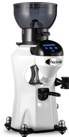
● Iconic-tron White

The striking Iconic-tron range take style and silence to new levels of sophistication and superiority. Equipped with the latest technology in noise-suppression and grind temperature. At only 45dB in operation, the powerful digital motor ensures perfect results, whilst the blue LED touch-screen keypad offers simple user interaction and an integral espresso shot timer. Available in Black, White and Red finishes, with bespoke colours available to order.