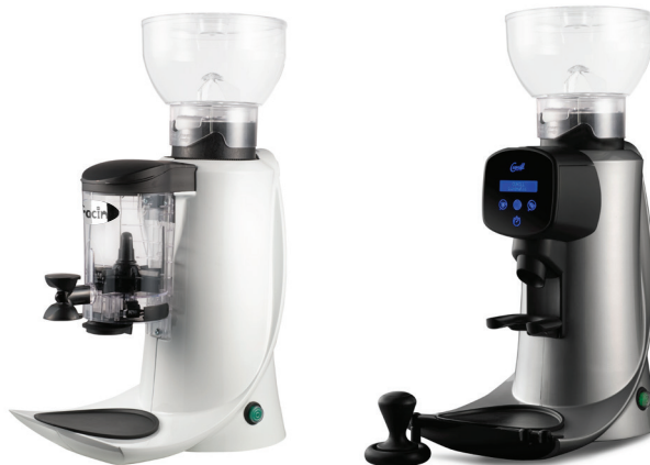
● Luxo White

The powerful Luxo and Luxomatic grinders are perfectly suited to the requirements of the busy restaurant and coffee bar. The near silent 55db operation ensures that they never intrude in a quiet location. Equipped with the most sophisticated sound proofing technology, these high quality models, with their modern stylish design are the perfect choice for venues seeking sophistication with easy, consistent operation. The Luxo model is fitted with an integrated dispenser, whilst the Luxomatic features touchscreen, on-demand grind operation. The smart LED keypad allows the user to programme grind time for single or double espresso shot or constant operation. Colour options available are White or Silver