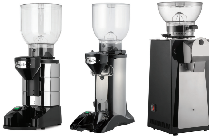
● Deli Low Volume

The Deli grinders are suitable for grinding all blends of coffee to be retailed by the bag and are available in three different sizes dependent on usage and volume. All models are suitable for espresso through to filter grind. The low volume dell grinder will grind 4 - 6 kilos per hour with a maximum running time of 20 minutes. The medium volume dell grinder will grind 6 - 10 kilos per hour with a maximum running time of 30 minutes. The high volume dell grinder is made entirely from stainless steel and has a unique vibration mechanism to ensure coffee settles into the bag. It will dispense between 10 and 15 kilos per hour with a maximum running time of 30 minutes.