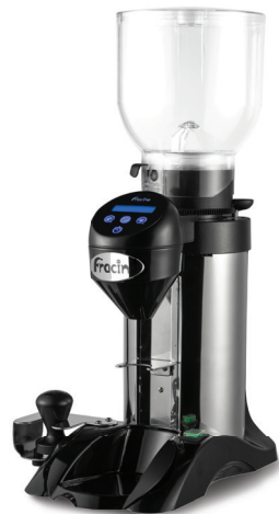
● Kenia-tron On Demand

The Kenia-tron is the perfect balance between performance and budget. A cost-effective, but powerful grinder, it also features a stylish touchscreen selector pad with blue LEDs for single, double or individual timed 'on demand' grind dose operation. The stylish contrasting black and polished stainless steel finish ensures it suits every location.